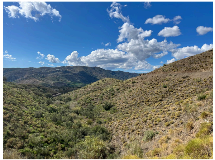
Valley proposed for the landfill site

Residents and neighbours of Canillas de Aceituno, a picturesque village nestled in the heart of the Axarquía, are rallying against a proposed waste recycling plant and landfill slated for construction in their serene and beautiful environment. Known for its breathtaking landscapes, diverse wildlife, and cultural heritage, the valley is an integral part of the region's identity and tourism economy. Locals fear that this industrial development will irreparably damage the area's environment, and deter visitors seeking the tranquillity of rural Spain.